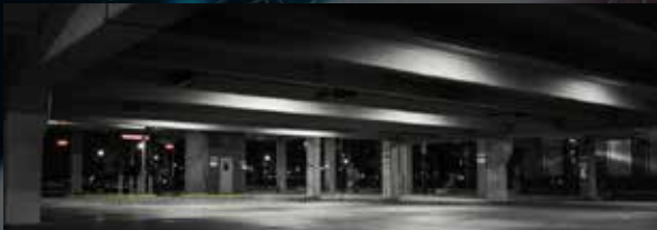
Parking Guidance System

Packet 360 empowers you to modernize, enhance, and expand your current parking setup, delivering a next-generation technological edge. Each project is meticulously planned and customized to ensure optimal performance and unmatched reliability from start to finish. While the concept of quality is widely explored, reliability remains the defining factor and it's where Packet 360 truly excels.