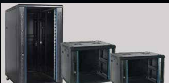
Racks & Enclosures