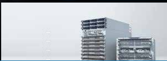
Data Center Switches