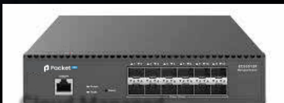
Cloud Managed Switches