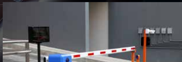
Parking Management System