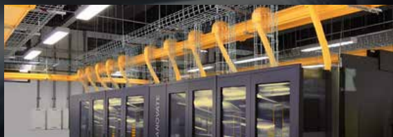
Fiber Raceway System