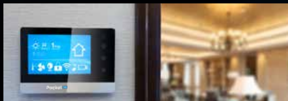
Smart Room Access