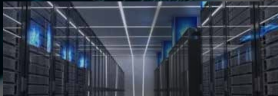
Cooling & Power Distribution

Choosing Packet 360 means investing in reliable technology and gaining peace of mind through a partner committed to long-term value and stability.