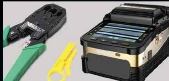
Tests & Tools