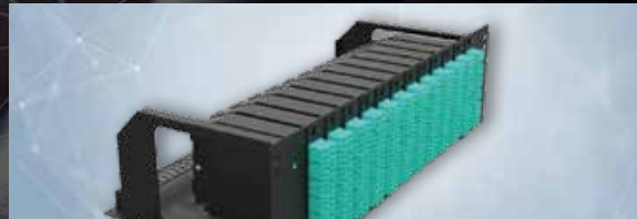
Ultra High Density Panels