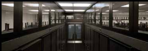
Racks Aisle Containment