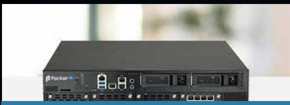
Next Generation Security Gateways