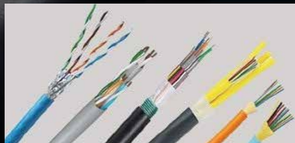
Fiber And Copper Cables